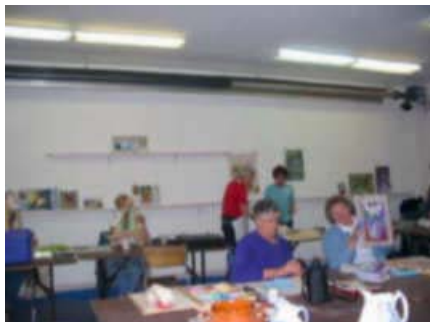
In the studio painting the lilacs

The lilacs were past their best but we managed to find enough along with other items to paint. As always it was a great time for gossip and new ideas.