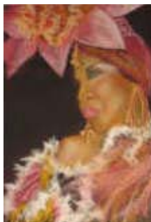
Fiesta by Louise Rouleau