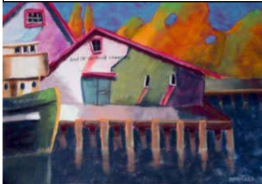
Gulf of Georgia Cannery