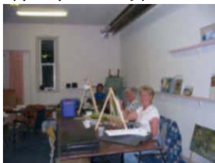
Staying away from the mosquitoes and cold.

Looking forward to next year, we have a very relaxing time of doing our own thing, so come join us for June 11, 12 and 13, 2004.