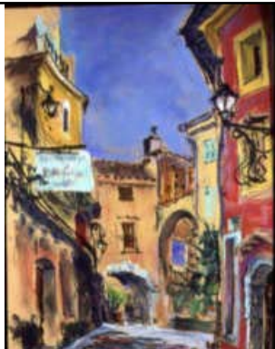
Roquebrune by Inak Gieysztor