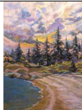
Pebble Beach by Elsa K. Black