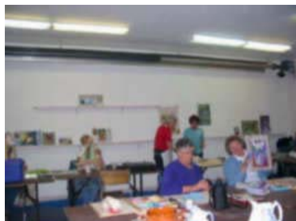
In the studio painting the lilacs

The lilacs were past their best but we managed to find enough along with other items to paint. As always it was a great time for gossip and new ideas.