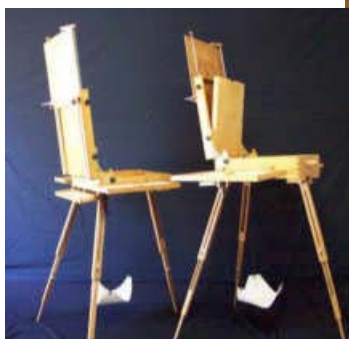
The boxes come in two sizes.

The boxes show the Inner box for holding 6 finished 12"x 16" paintings; the pastel dust catcher; the rear tray holder (for pastels you are working with), the rock holder for stabilizing the box in highwinds.