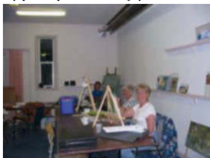
Staying away from the mosquitoes and cold.

Looking forward to next year, we have a very relaxing time of doing our own thing, so come join us for June 11, 12 and 13, 2004.