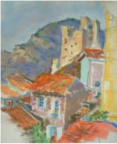
Painting by Inak Gieysztor (See page 5)