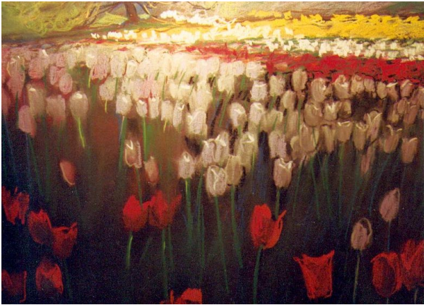
Tulip Flowers -Thu Tran