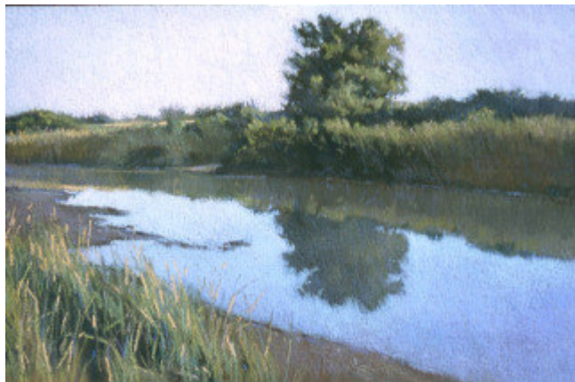
Summer Morning Light

Then registration is open to all on a first come first served basis. Deadline April 20, 2006 There is a lot of interest in this workshop - so do not hesitate.