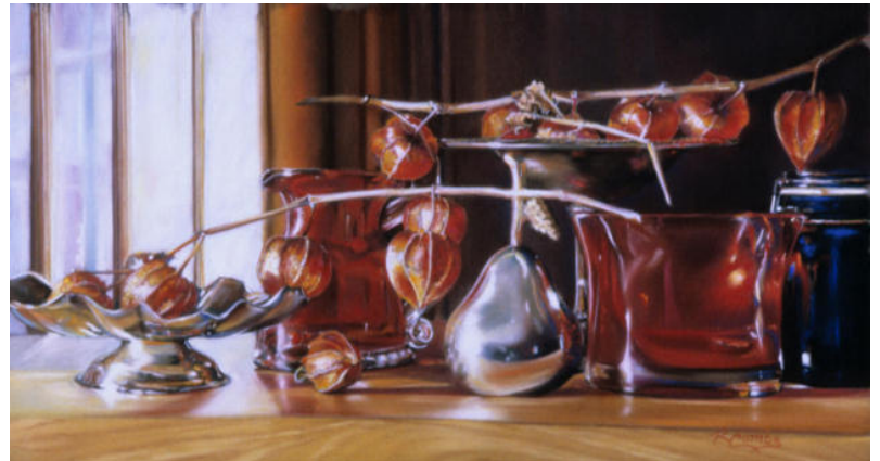
Chinese Lanterns, Roberta Combs