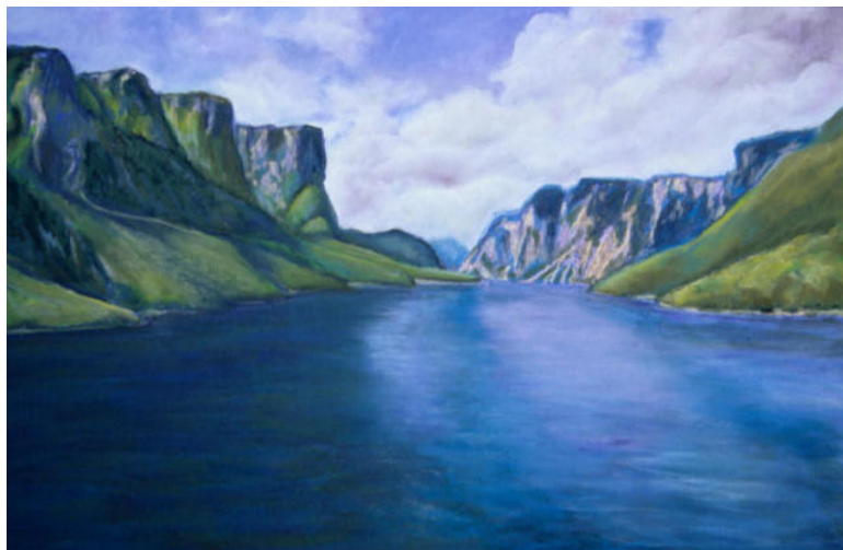
Leaving Western Brook Pond , Rosemary Simpson